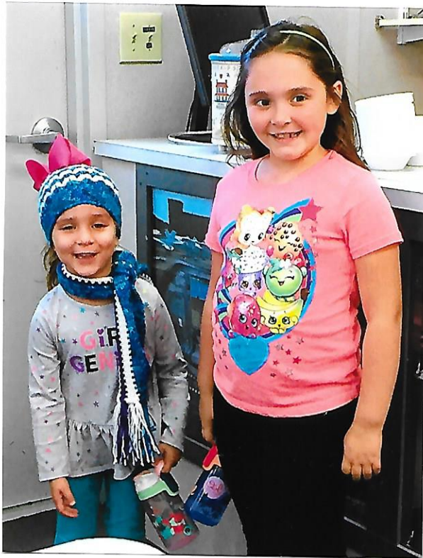
The pretty little Hills girls