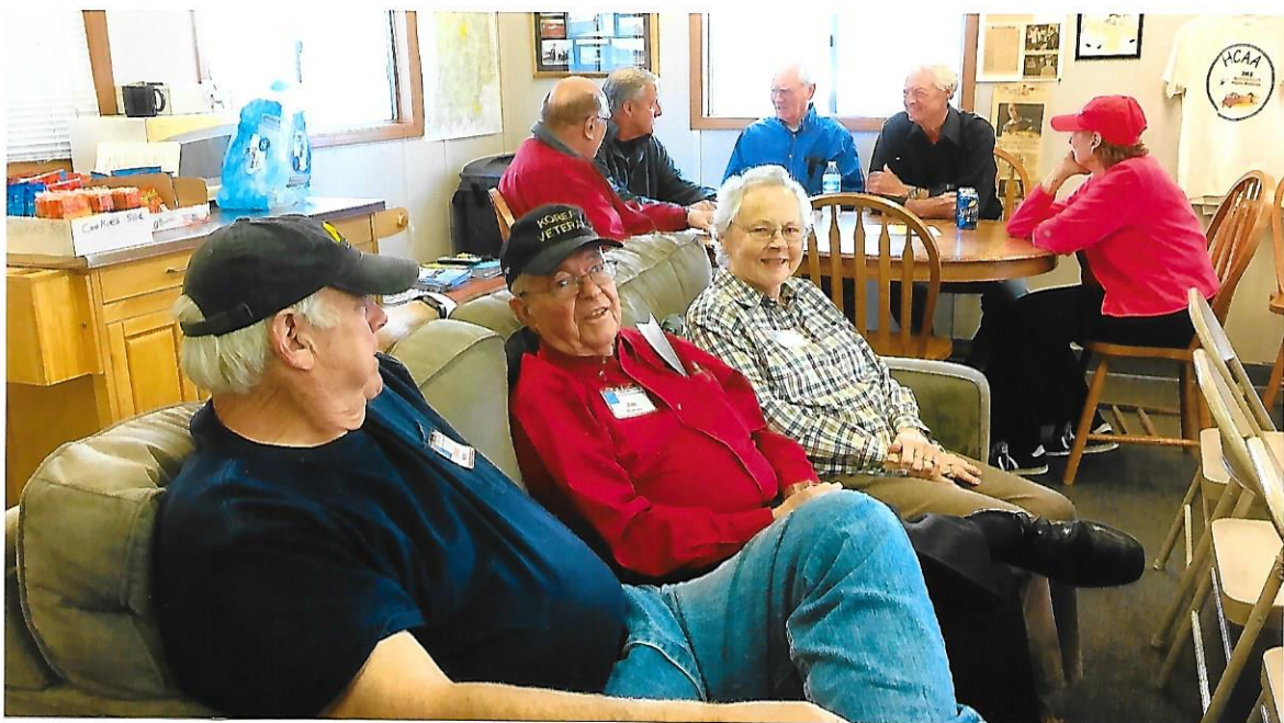
Relaxing and waiting for the crowd to gather!