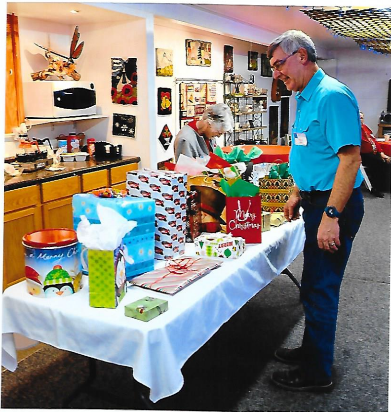
Reed checks the gifts