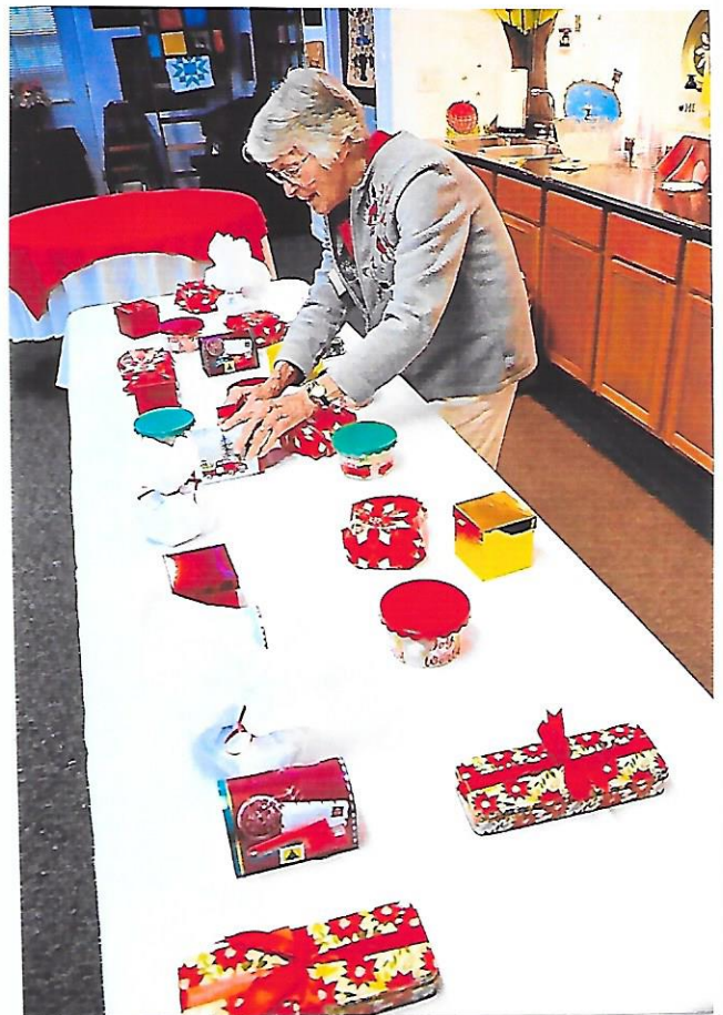
..... and then displays the door prizes