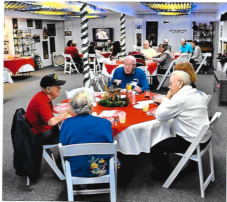
Waiting for the main course.