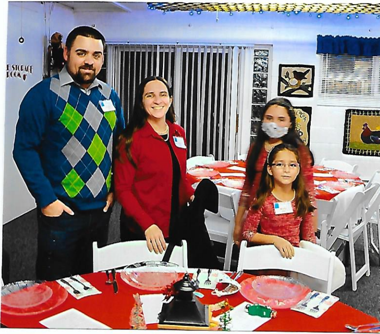
The Hills family