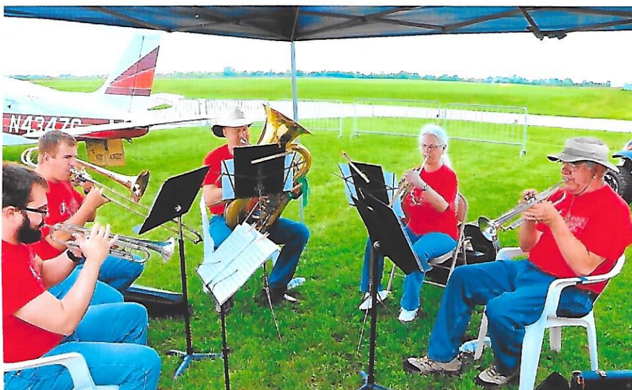
Hendricks County Symphony Members