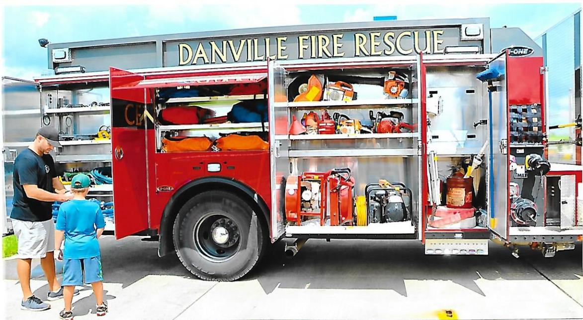
The Danville Fire Department and Medivac exhibits were crowd pleasers.