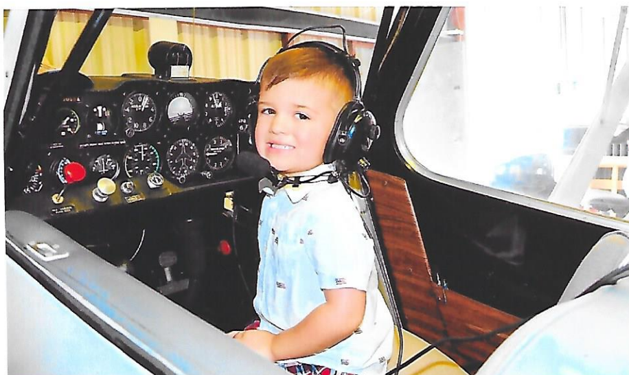
Future Airline Captain