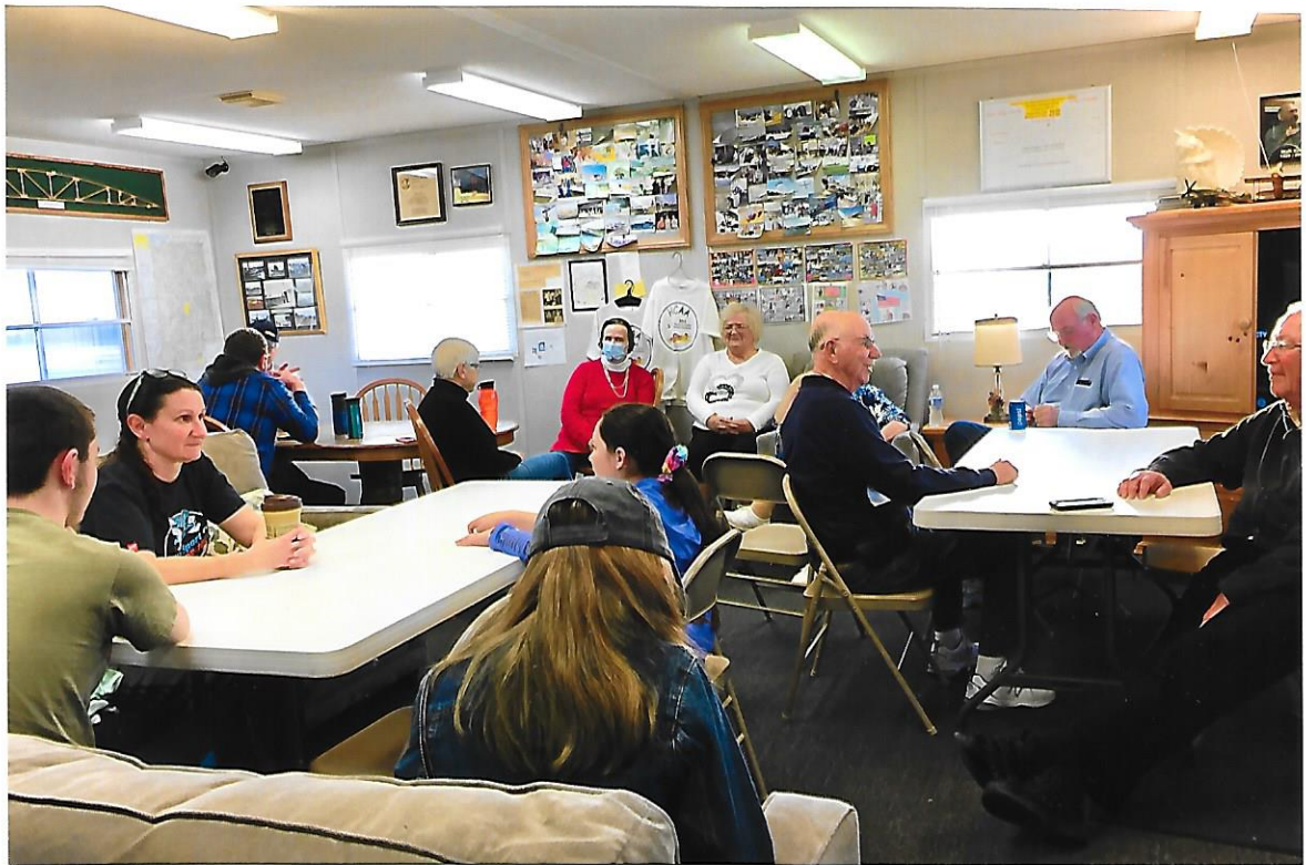
Waiting patiently for the pizzas to arrive