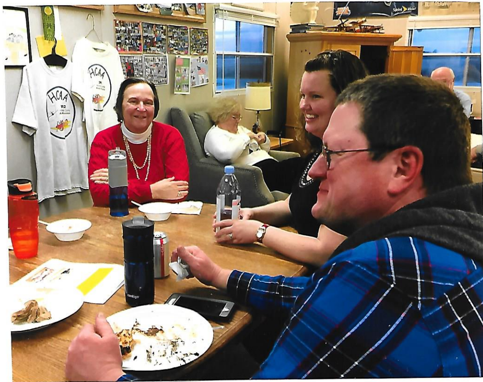
Relaxing after feasting on the pies.