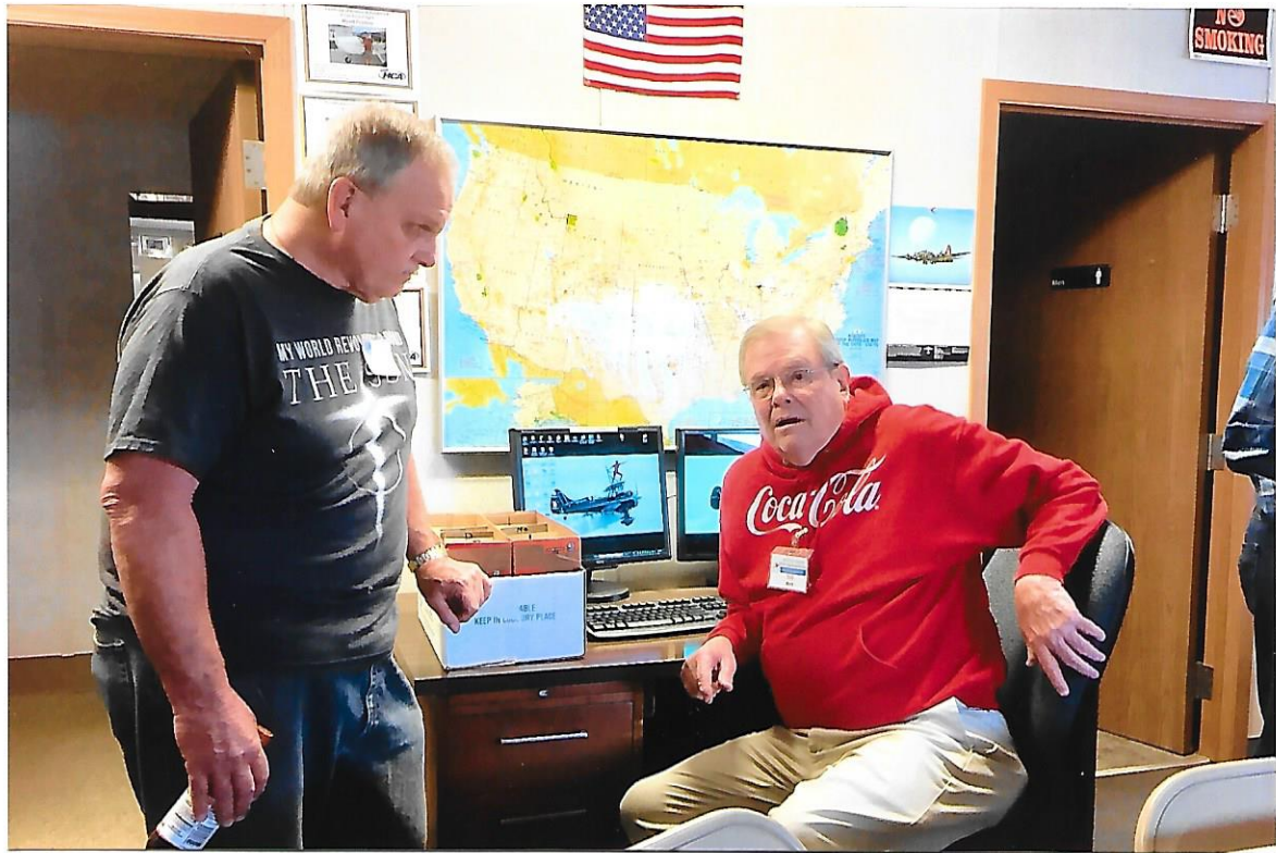
Catching up on the news