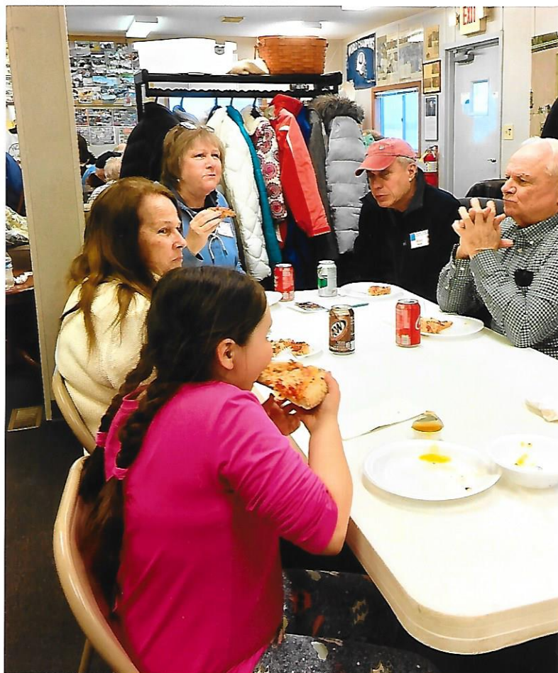
The pizza has arrived. Let's eat.