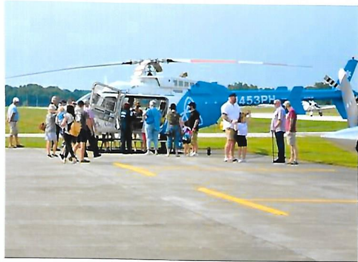
Medivac attended this year