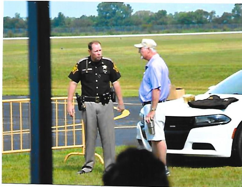
The Sheriff's Department was represented