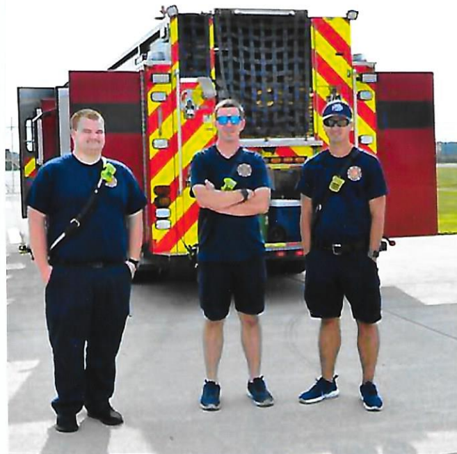
Above - The Danville Fire Department was represented