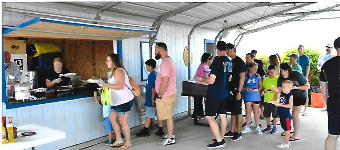
Time for Lunch