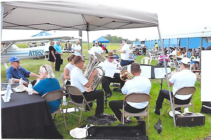
Left - The Hendricks County Symphony provided musical entertainment