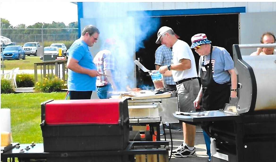
Below – Lots of good help