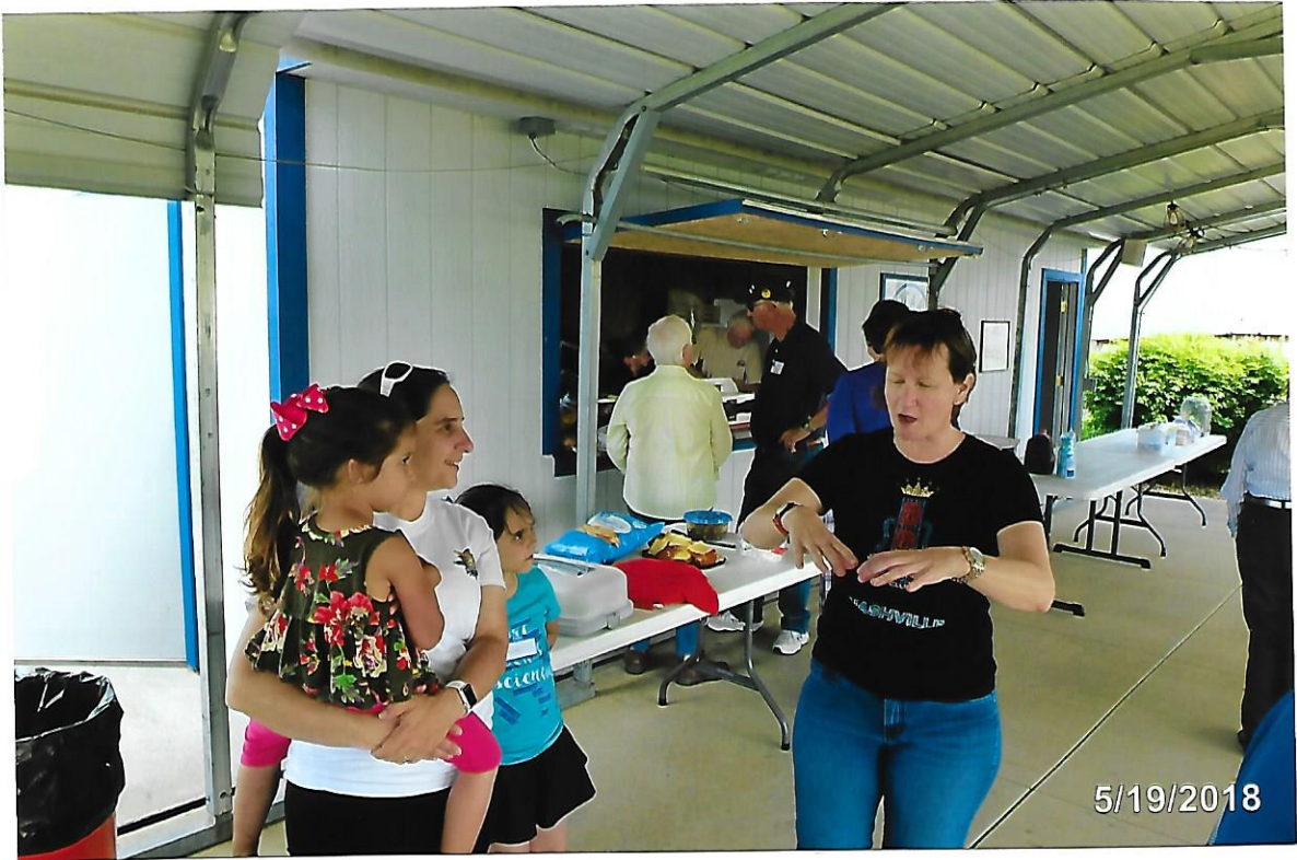
Talking and eating