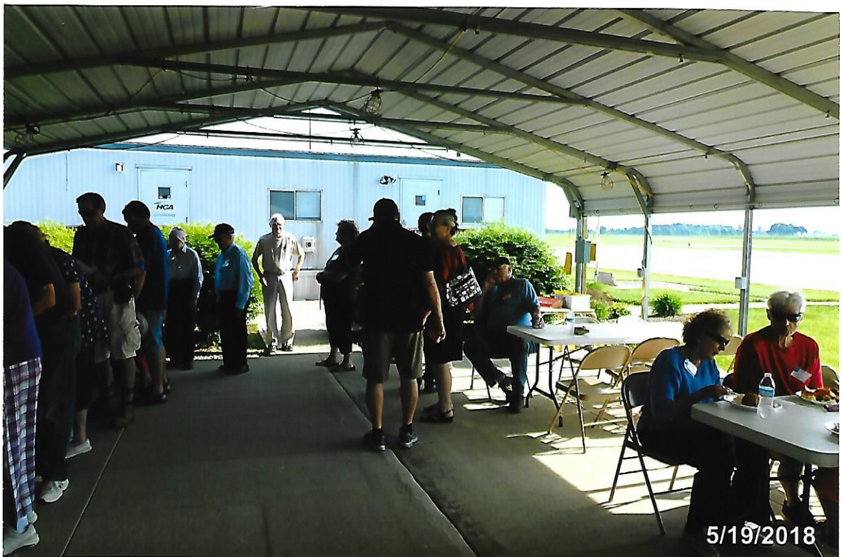
A good turnout