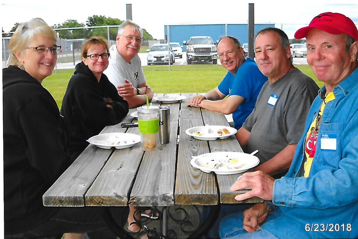
Happy folks. (Just finished dessert)