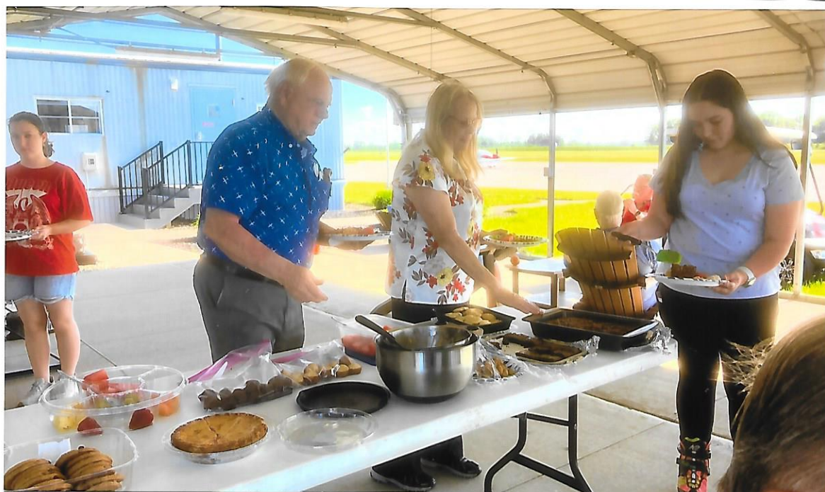
At the dessert table (it's loaded)