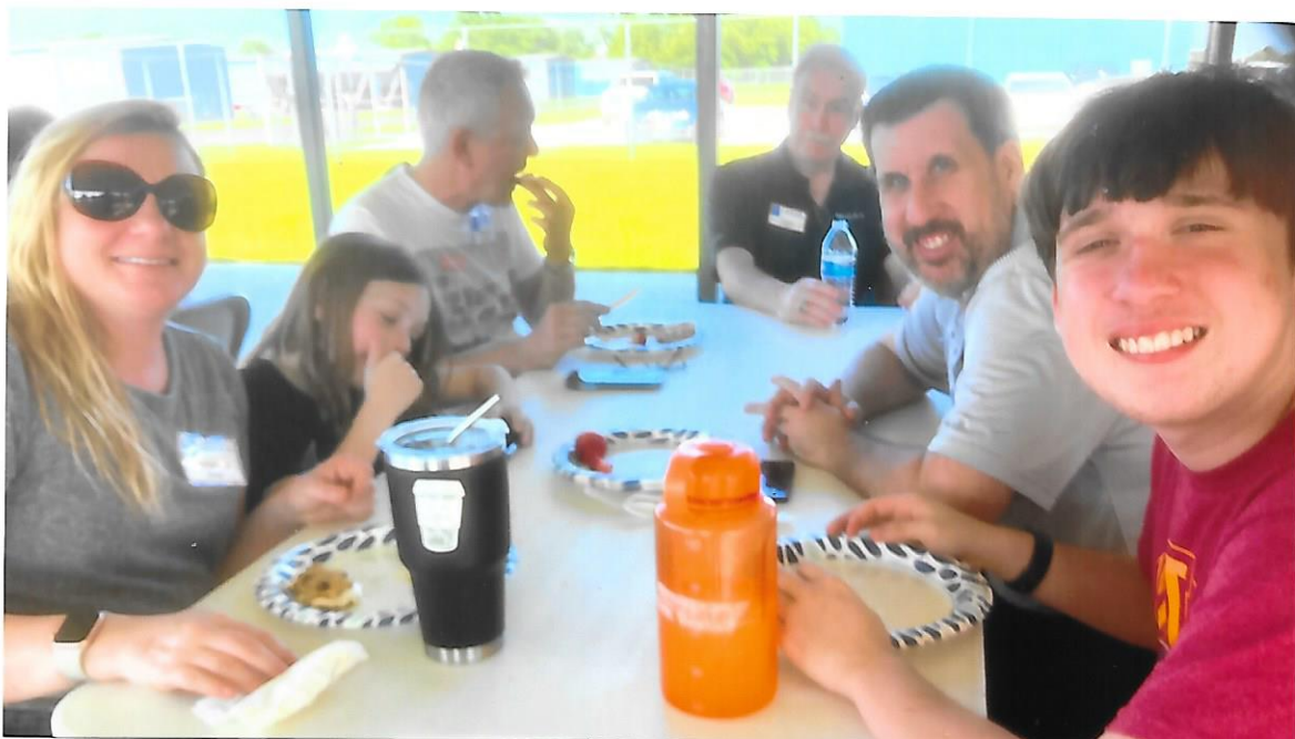
Everyone enjoyed the food