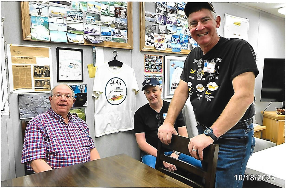
Several more "waiters"